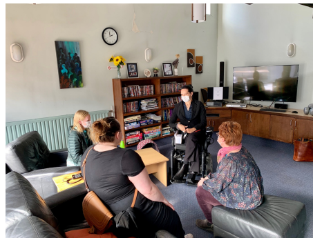
BAIL staff engaging with students at ARA as they delivered the Independent Living paper.